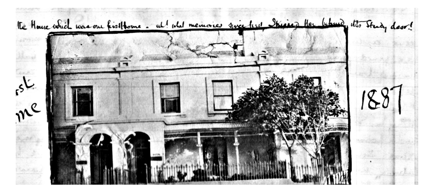
Figure 6: 'Our first home'

On their return to Melbourne on 18 February, the couple lived first in an old house at 168 Collins Street.